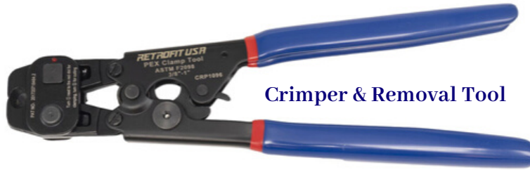
Crimper & Removal Tool

Tool Available for sale at www.Retro-FitUSA.com